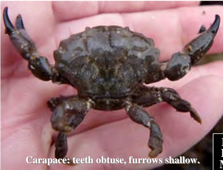
Carapace: teeth obtuse, furrows shallow.