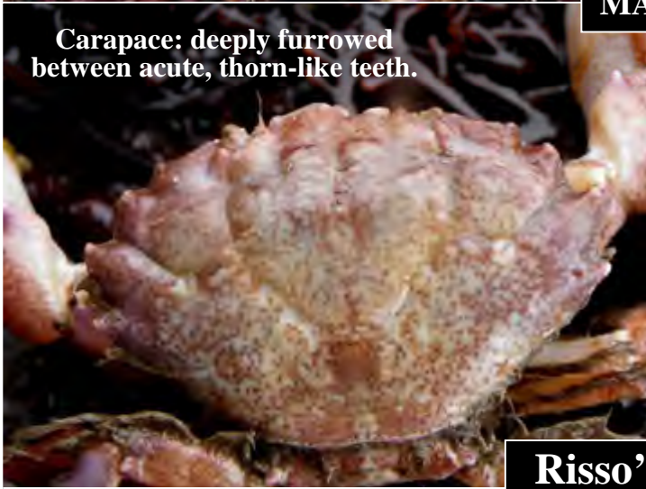
Carapace: deeply furrowed between acute, thorn-like teeth.