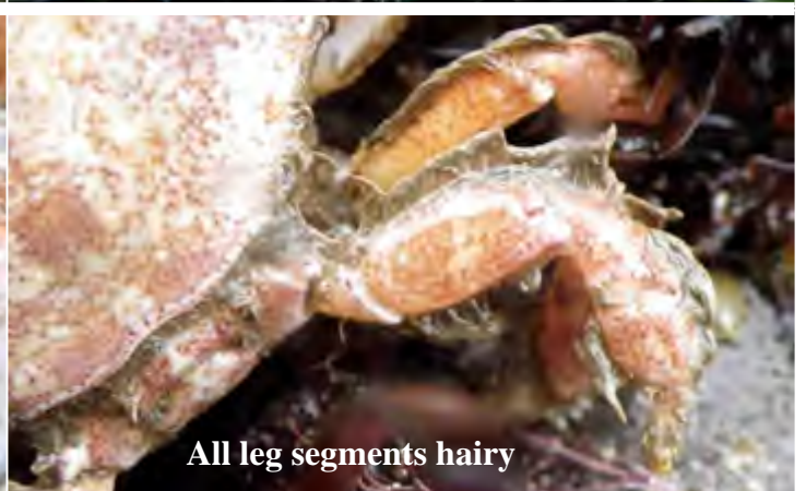
All leg segments hairy