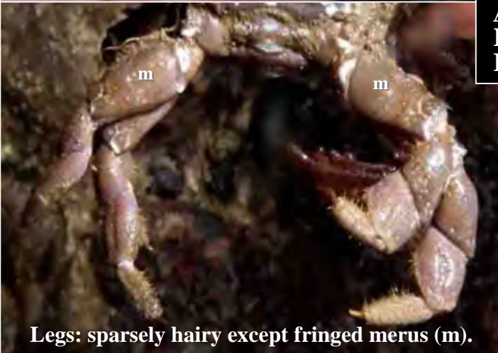
Legs: sparsely hairy except fringed merus (m).