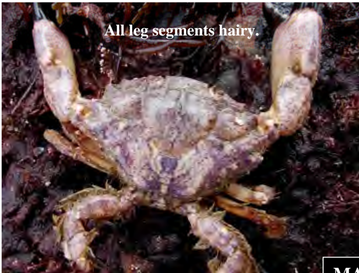
All leg segments hairy.