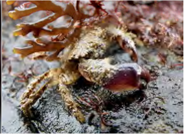
Hairy Crab Pilumnus hirtellus

Hairy carapace Hairy legs (all) Unequal 'pincers' Adult 1 – 1.5 cm