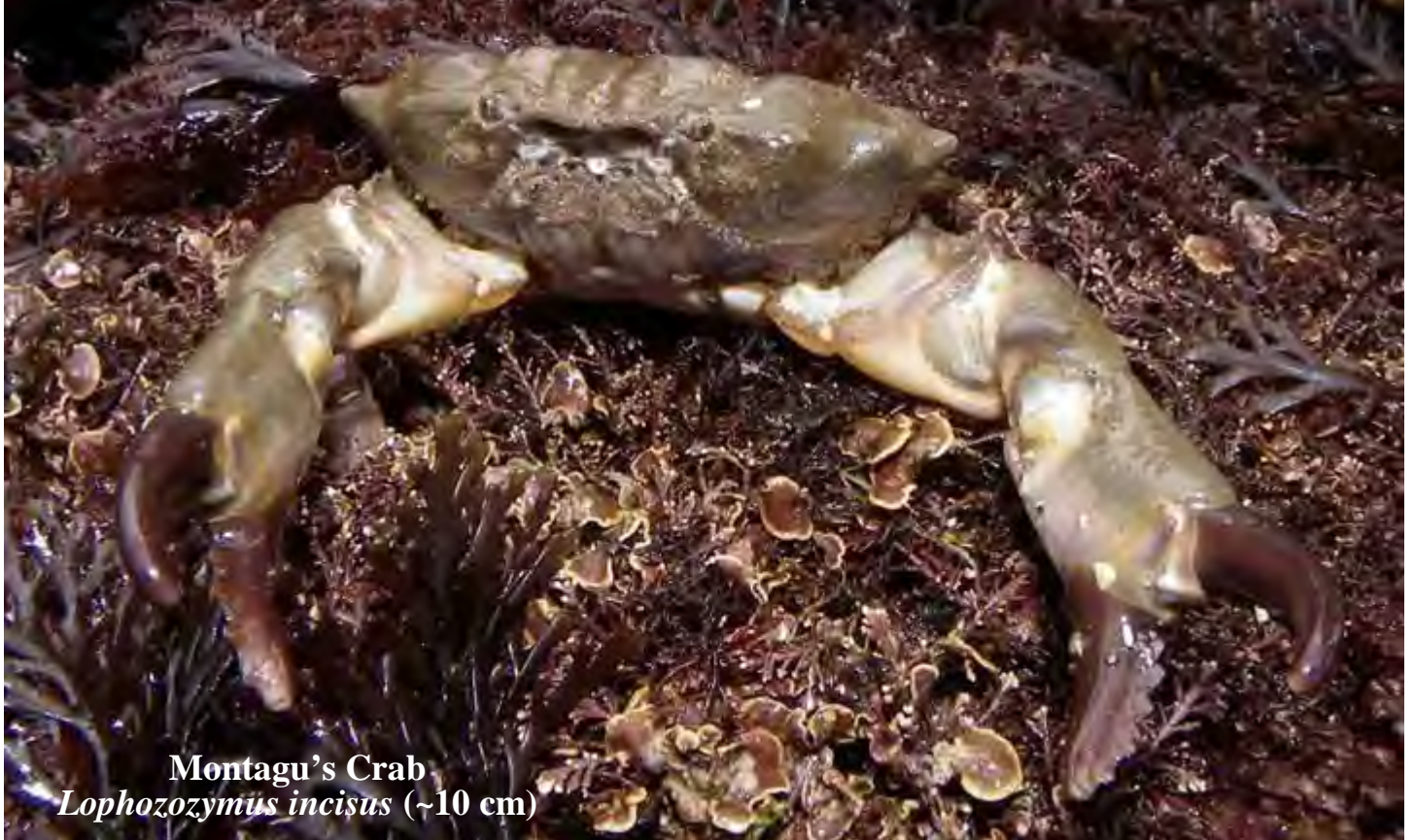
Montagu's Crab Lophozozymus incisus (~10 cm)