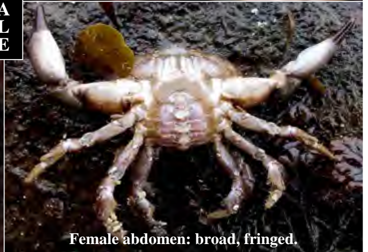
Female abdomen: broad, fringed.