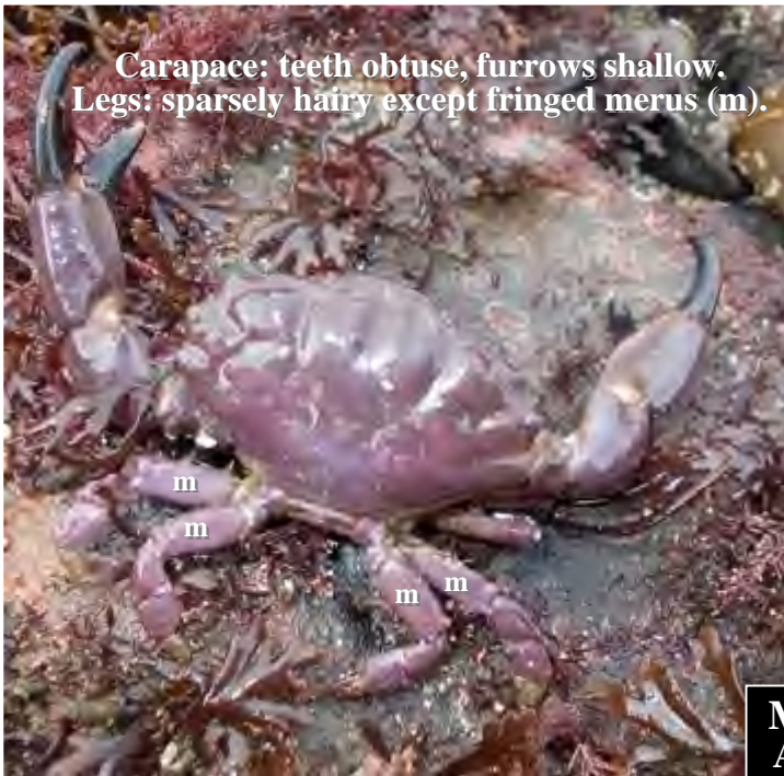
Carapace: teeth obtuse, furrows shallow. Legs: sparsely hairy except fringed merus (m).