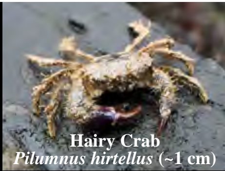
Hairy Crab Pilumnus hirtellus (~1 cm)