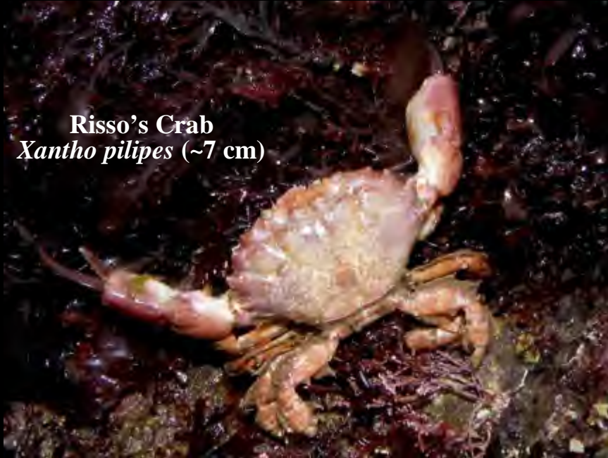
Risso's Crab Xantho pilipes (~7 cm)