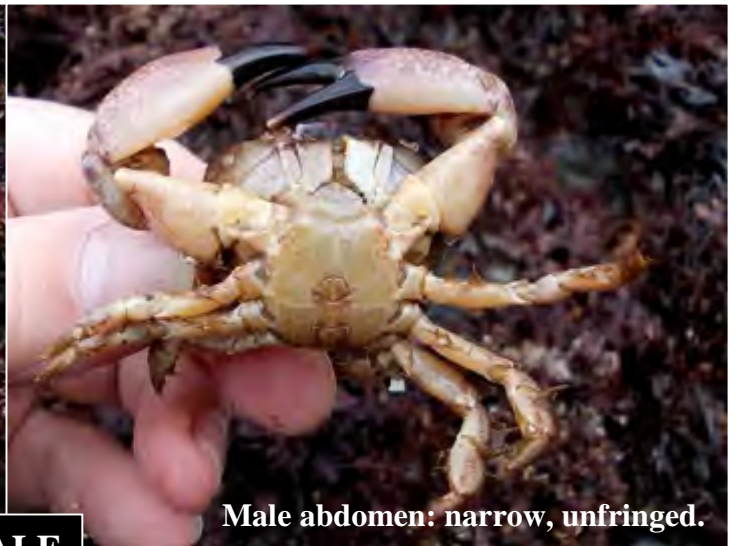
Male abdomen: narrow, unfringed.