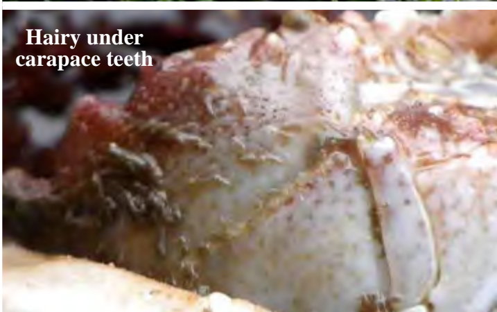
Hairy under carapace teeth