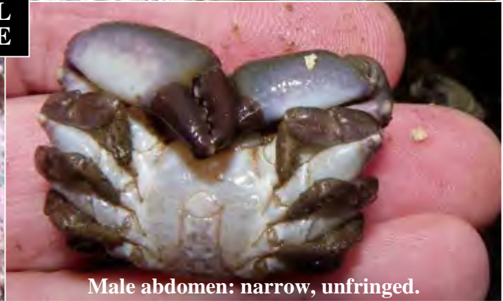
Male abdomen: narrow, unfringed.